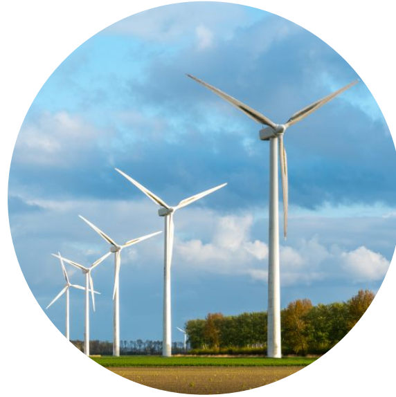
Ireland Strategic Investment Fund and National Reserve Fund