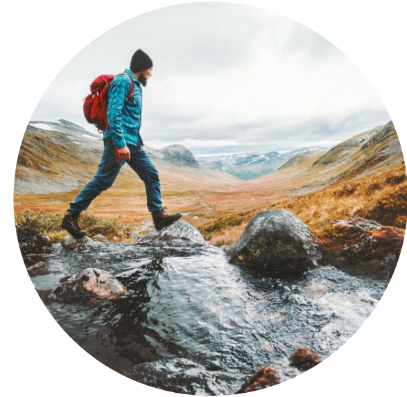
IORP II driving Master Trusts